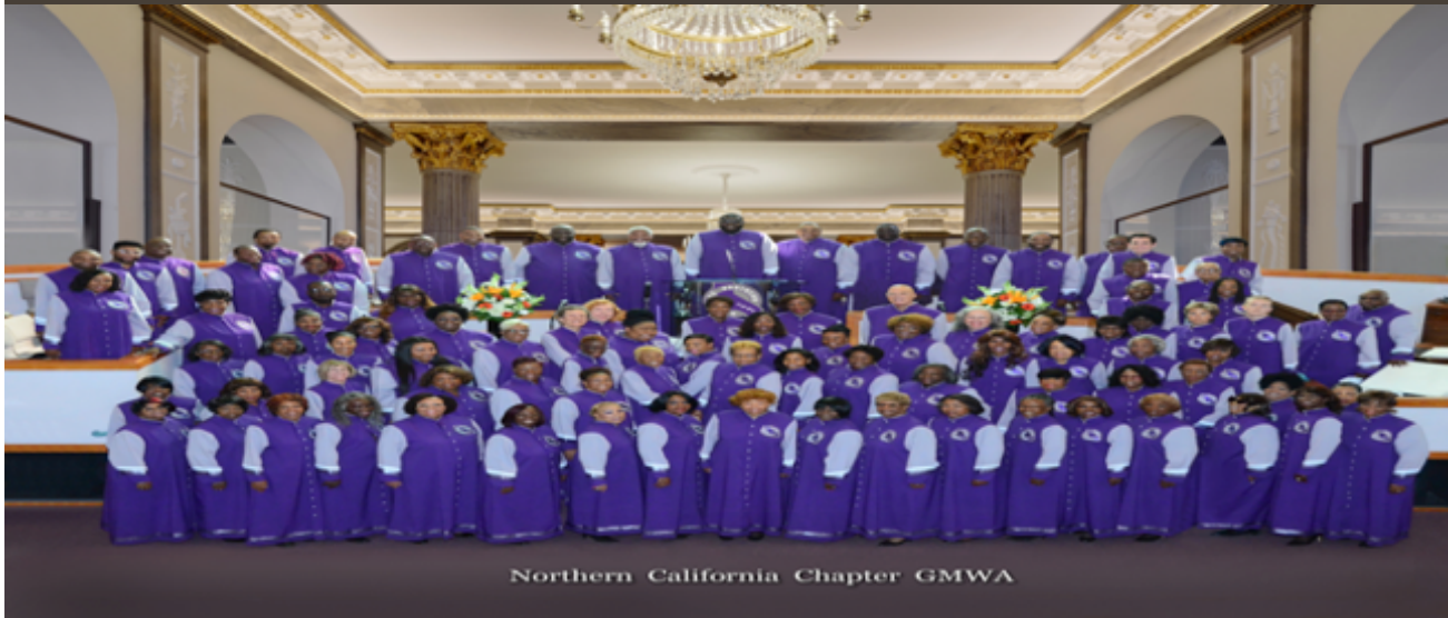
Northern California Chapter GMWA